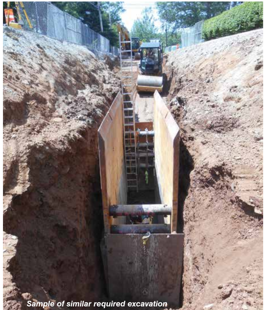
Sample of similar required excavation

The new sewer pipe will extend approximately 600 metres from Guildwood Cres. to Carnation Cres. Construction is expected to begin in May or June and take 3-4 months to complete. Due to the depth of the pipe excavation, Leiblin Drive will be closed to traffic for the duration of the sewer project.